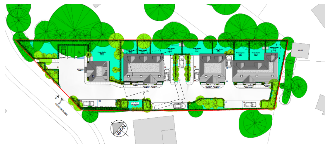
Figure 4: Site Plan