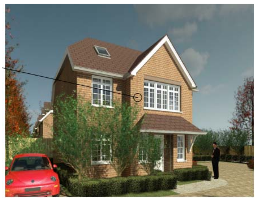
Figure 1: Proposed front view of detached dwelling fronting onto Kearton Close