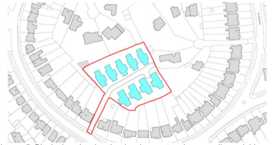
Image 5: Block plan showing the development and surrounding neighbours

8.19 For other neighbours, apart from 14 Pollards Hill West which has a single storey rear extension approximately 15 metres from the proposed development, each would be at least 18 metres from the new homes as recommended for window to window separation within the Suburban Design Guide (2019). Since the original submission the scheme has been amended so to remove the rear south facing terraces on Houses 6-9 and reposition them to the front. This would increase the protection afforded to the rear gardens of homes on Pollards Hill West from a loss of privacy. This is particularly important for House 6 and the relationship with 14 Pollards Hill West which is the closest neighbour to the south. The orientation of House 6 toward the south-east rather than directly south would ensure this neighbour is not harmfully overlooked from the first floor kitchen/living/dining area and plans for this individual house show obscure glazing window to side window of the ground floor rear bedroom, so to further mitigate any potential loss of privacy 14 Pollards Hill West. Houses 1-5 have similarly been designed so to minimise any effect upon adjoining neighbours on Hill Drive. It is considered that there would be no harm to neighbours through loss of light, outlook or privacy.