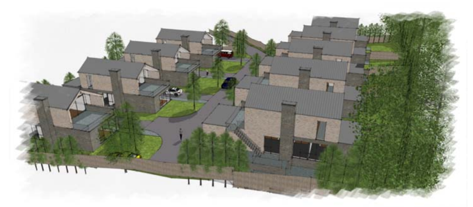
Image 3: Visual from the east showing 'House 9' (near left) and 'House 5' (near right)

8.17 Policy DM10.6 states that the Council will not support development proposals which would have adverse effects on the amenities of adjoining or nearby properties, or have an unacceptable impact on the surrounding area. This can include a loss of privacy, a loss of natural light, a loss of outlook or the creation of a sense of enclosure.