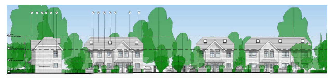
Figure 2: Proposed view within the development site