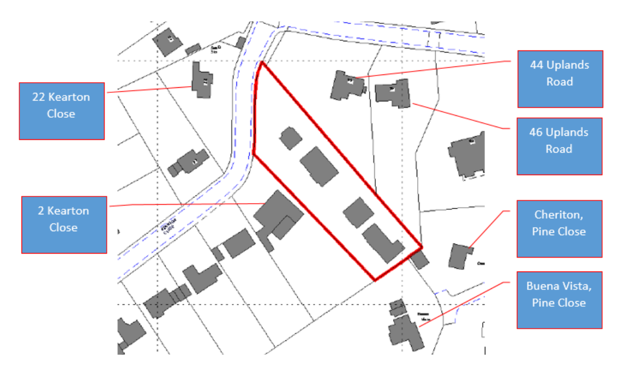
Fig 5: Block plan showing proposed dwellings and surrounding neighbouring properties